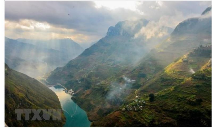
Nho Que river in the northern mountainous